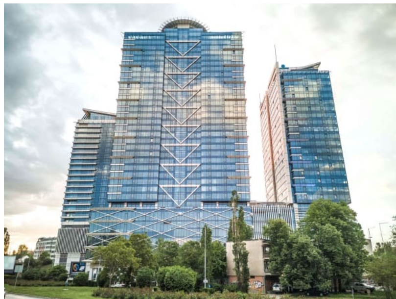
Grand Hotel Millennium Sofia